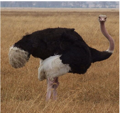
Image was created by Nocor and is published on Wikimedia Commons under a CC BY license.

2. How do you think the animals pictured on the left ended up in the Ming Dynasty's imperial zoo in China?