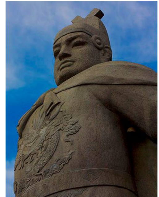
Modern day statue of of admiral Zheng He, located in Malaysia.

Adapted from the New York State Education Department. June 2004. Global History Exam. Internet. Available here ; accessed July 19, 2017.